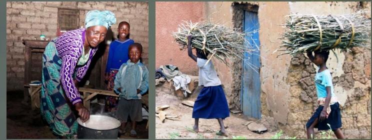
IGCP = International Gorilla Conservation Programme (igcp.org)

The goal of this project, which is led in Rwanda by our partner IGCP, is to reduce firewood demand around Volcanoes National Park by 70% with the distribution of 50,000 locally-made stoves that require two-thirds less firewood than traditional stoves. This helps reduce deforestation and the number of people entering the park illegally, thereby protecting gorilla habitat and reducing the risk of disease transmission between people and gorillas. These clean-burning stoves are also less damaging to human health by reducing soot particles in the air. Finally, this Gold Standard-verified project keeps 60,000 tons of CO 2 (greenhouse gas) out of the atmosphere every year. It's a win for gorillas, people and the planet.